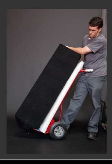
If it is necessary to move the speaker from the crate to the listening position, use a hand truck with a study piece of foam to protect the speaker.

Tilt Speaker up on to a soft surface, Make sure that back of speaker does not hit the crate and that the binding posts do not touch the floor.